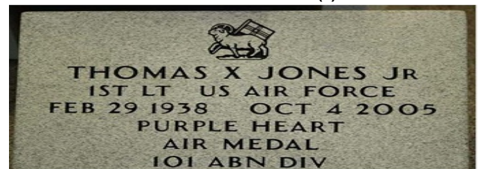
SMALL FLAT GRANITE (L)

This grave marker is 18 inches long, 12 inches wide, and 3 inches thick. Weight is approximately 70 pounds. Variations may occur in stone color.